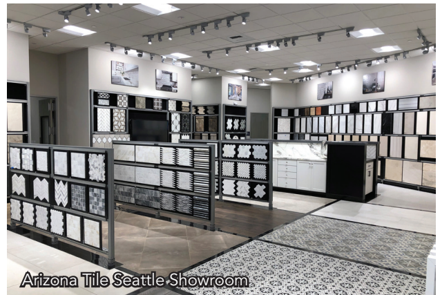
Arizona Tile Seattle Showroom