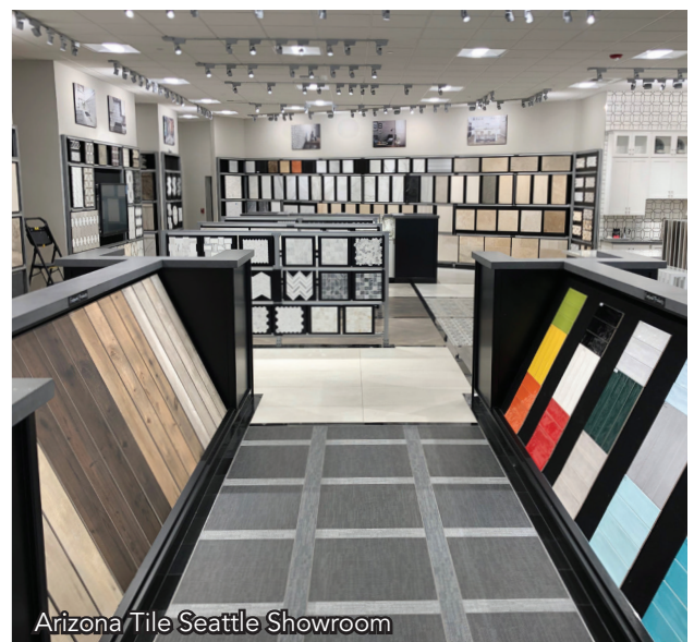
Arizona Tile Seattle Showroom