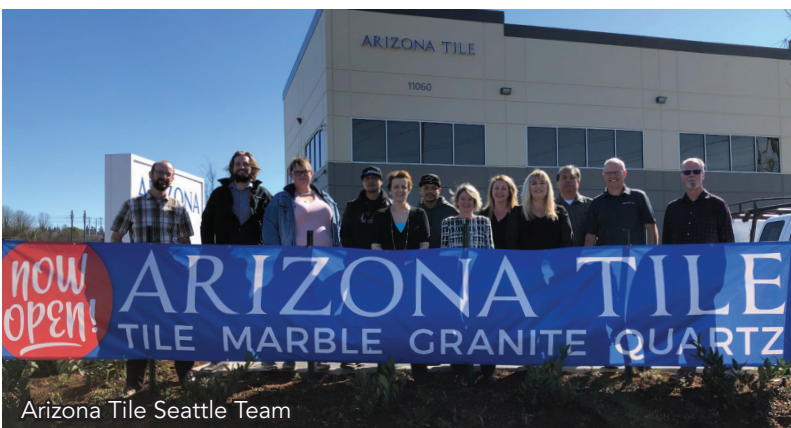
Arizona Tile Seattle Team