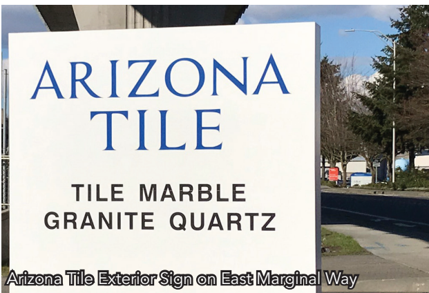
Arizona Tile Exterior Sign on East Marginal Way

How does our new showroom differ from our competitors in the area? Our new Seattle showroom is a 6,000 square foot product showcase and design inspiration gallery combining floor and countertop/backsplash installations. In addition to these spaces, concept panels are scattered throughout, all of which help to visualize the “installed product picture”; a tried and true method for helping our customers see their ideas conceptualized. Also, our Just Imagine design creation platform allows for customer customization to the max!