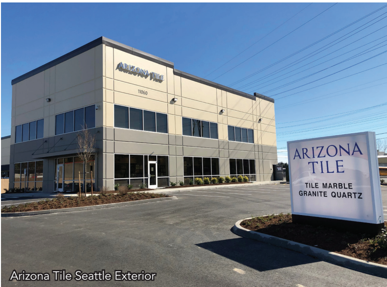
Arizona Tile Seattle Exterior

On March 18 th 2019, Arizona Tile opened the doors to its newest branch, located in Seattle, Washington . The site is home to an interactive showroom, slab viewing facility, and order desk, and highlights the use of modern technology in which customers can visualize materials in their own home by use of the on-site touch-screen. Customers can also find inspiration via the wide variety of installation examples throughout the showroom floor.