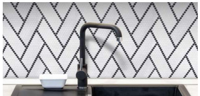
Geo 2-Harmonie Outro