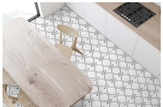
Geo 2-Bisou Sunset