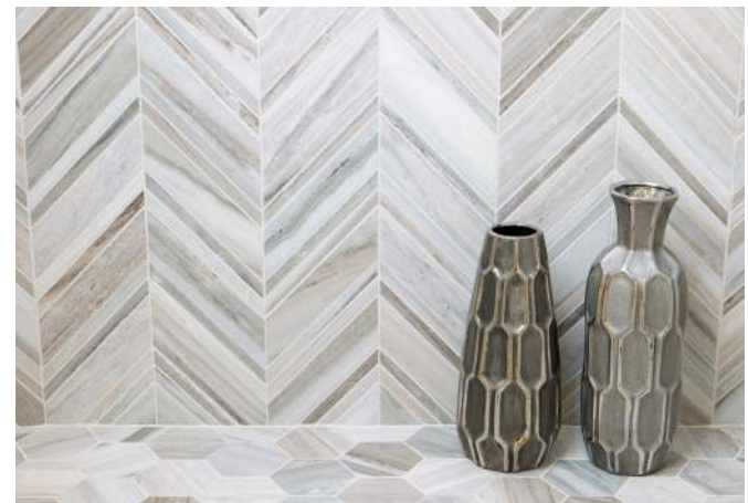
CS-Skyline Honed Chevron Mesh & Honed 4 Inch Hex Mesh