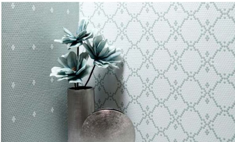
Geo 2-Thyme with Cotton inserts (left) & Geo 2-Bisou Dawn (right)