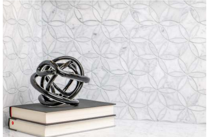
CS-Bianco Venatino Honed Flower Mesh