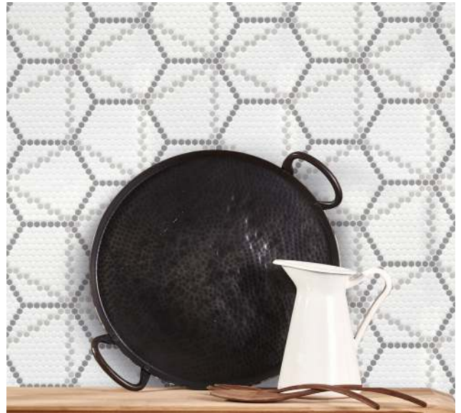
Geo 2-Metro Uptown

Geo 2 is Arizona Tile's newest glass mosaic series featuring contemporary, geometric patterns in a stylish color palette. Created from recycled glass, this mini hex includes three patterns and five solid colors - both work well together as feature and accent pieces in your design. Its recommended uses include interior floors and walls, shower floors and walls - including steam showers, and pool and spa, among others. Colored with inert natural minerals and enamel, this full body product is immune from fading or discoloration. Be sure to also check out the special order series, Geo, which offers additional patterns and colors as well.