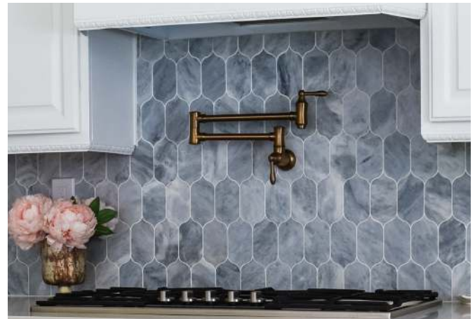
CS-Sky Blue Honed Lotus Mesh