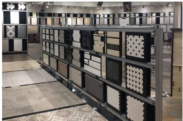
Arizona Tile Prescott Showroom Interior