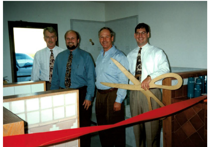
Prescott Ribbon Cutting Ceremony

What are some of the changes that you have seen, both in the area and in the store? Of course, the obvious answer is that there are more homes, businesses and people. And with that comes less open space and wildlife. However, with the growth comes more choices and variety in stores, as well as restaurants.