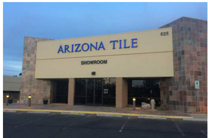
Arizona Tile Prescott Showroom Exterior