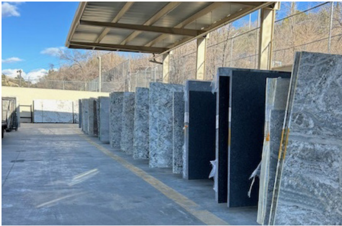
Arizona Tile Prescott Slab Warehouse