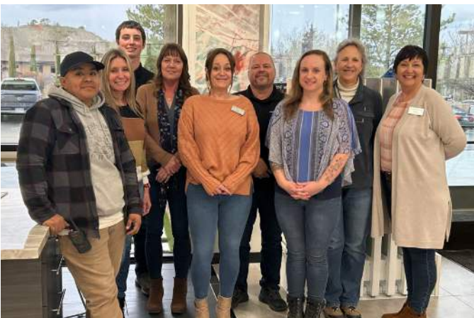
Arizona Tile Prescott Team